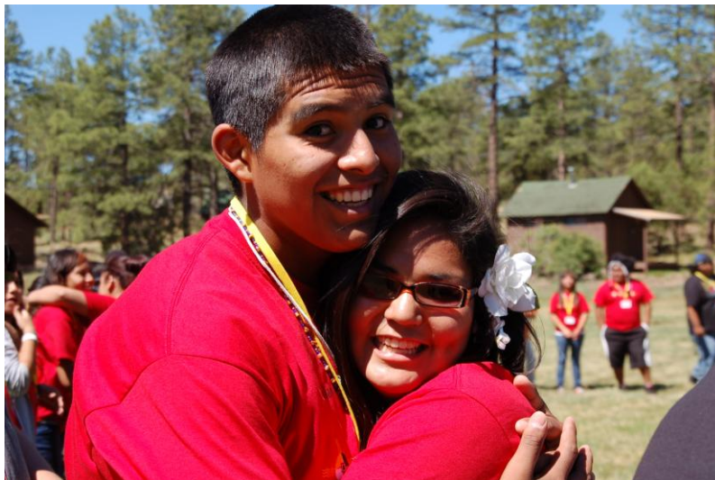
Welcome to Indian Nations!

TRANSPORTATION: Transportation will be up to each program to provide.