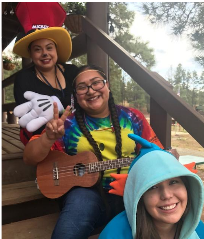
Welcome to Indian Nations!

TRANSPORTATION: Transportation will be up to each program to provide.